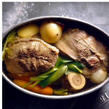
Pot au feu